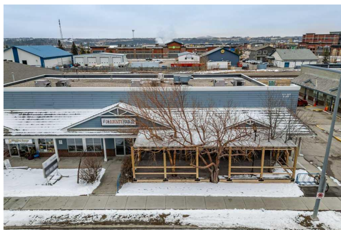
185 1 St E, Cochrane, AB

Main Floor Exterior Area 4639.87 sq ft Interior Area 4485.18 sq ft