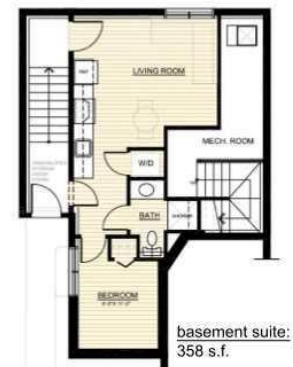
basement suite: 358 s.f.