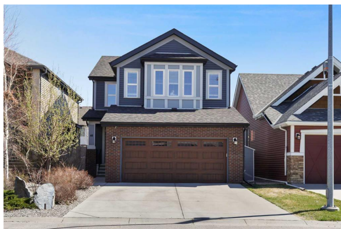
66 COPPERPOND HEATH SE

** Custom Former Show Home ** - Family Approved - Five bedrooms + two dens ** Extensive upgrades and superior quality, with 3,500 square feet of air-conditioned, luxurious living space. ** You will be impressed with the privacy of an oversized traditional homesite with a private south-facing backyard with a bespoke 13' x 12' covered deck. This seasonal, airy design provides relief from the sunniest to the snowiest days while providing an uninterrupted view of the surrounding gardens. Enjoy this convenient Copperfield Location - steps away from the ponds, Ice rink, parks, pathways, schools, shopping, soccer fields, skate park, healthcare, transit, South Pointe Hospital, and the major south expressways. Living a community lifestyle makes Copperfield an outstanding, safe, and secure community. Rich curb appeal with architectural features - dramatic roof lines, 24' x 21' attached garage with wood-style detailed door & full-sized concrete driveway, covered entry, and brick-faced front complete this spectacular elevation. There are extensive upgrades throughout, and the details are superb. This is a must-see home! Chefâ€™s kitchen includes granite countertops, custom light wood shaker style cabinets/doors, extension trims, high-end KitchenAid stainless steel fridge/dishwasher/microwave/wall oven, gas cooktop range with five burners, recessed lighting, oversized central island, peninsula island with a flush eating bar & black granite under mount sink, extra cabinet storage & a